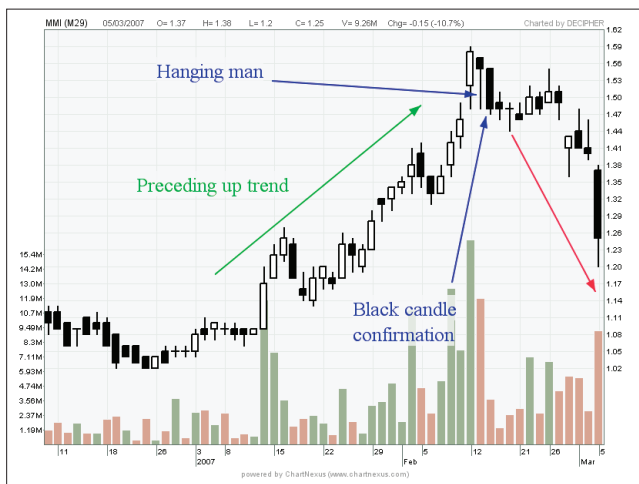
Figure 3: Hanging Man with black confirmation

As seen in Figure 2, there was a preceding downtrend before we observed that a Hammer was formed which is then followed