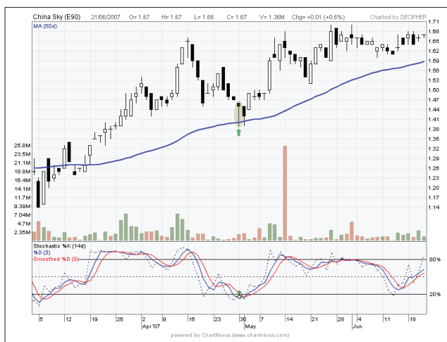
Figure 4: Example of Hammer resting on support

After learning how to interpret Hammer and Hanging Man patterns, we are going to explore another way of using this Hammer pattern to our advantage with or without the white candle confirmation. Since Hammer and Hanging Man reflects a strong change in power between the bulls and the bears, it will be very effective if we can spot them near support or resistance levels. These can be determined either by trend lines, Fibonacci levels, moving averages and so on. Alternatively, we can use an oscillator like Relative Strength Index (RSI) or Stochastics together with the pattern too.