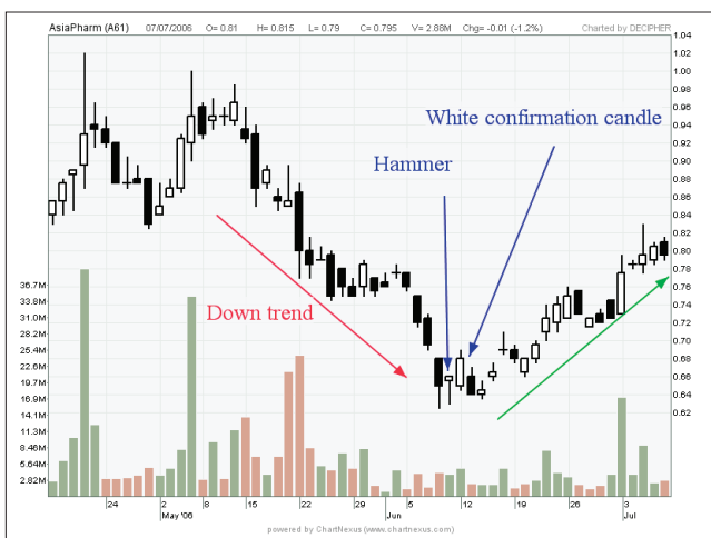
Figure 2: Hammer with white candle confirmation

In order to use a Hammer pattern effectively, we have to identify the preceding trend before the pattern is formed. This is because while the pattern formed after a downtrend is known as a Hammer, the same pattern can be formed after an uptrend and is known as a Hanging Man. The interpretation is different. When a Hammer pattern is formed, we observe that the bulls are strong and managed to beat the bears by closing the price way above the low of the day. However, when a Hanging Man is formed, we interpret the pattern differently. We observe the long lower shadow as evidence that the bears are flexing their strength in the uptrend but the bulls still manage to stay in control and close the price way above the low during that day. When we trade a Hammer or Hanging Man, we want to see a white confirmation candle and a black confirmation candle respectively.